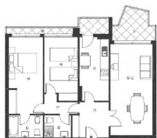
Piso en calle Agustinas Zarandona (Murcia)

Plano orientado, no corresponde documento contractual. Mobiliario indicativo de posible distribución