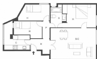
Piso en Plaza Falguera St Feliu de Llobregat

Plano orientativo, no constituye documento contractual. Mobiliario indicado de posible distribución