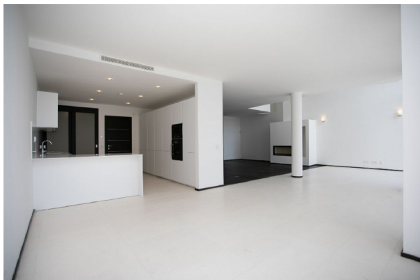
Vivienda en calle Verdi Marbella (Málaga)