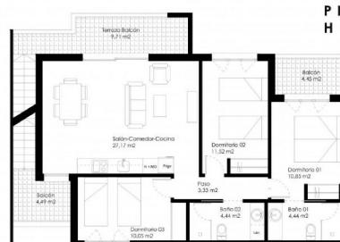
Planta primera_Escala: 1/100